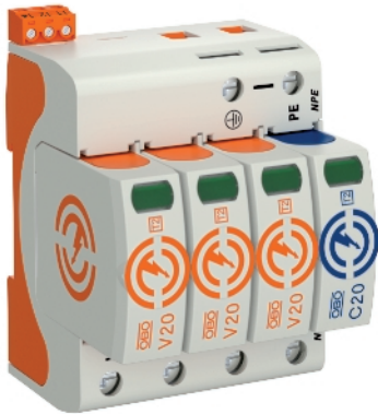
Surge arrester, type 2